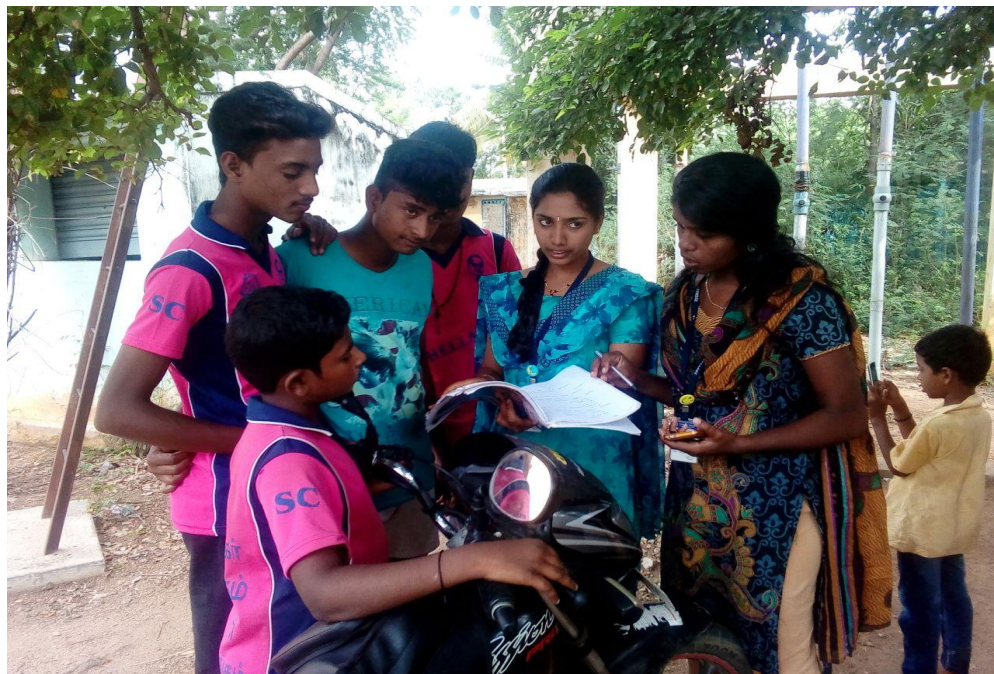
Awareness on Banning Plastics at Sagathevapatti on 28 th June, 40 residents got benefited from the program.