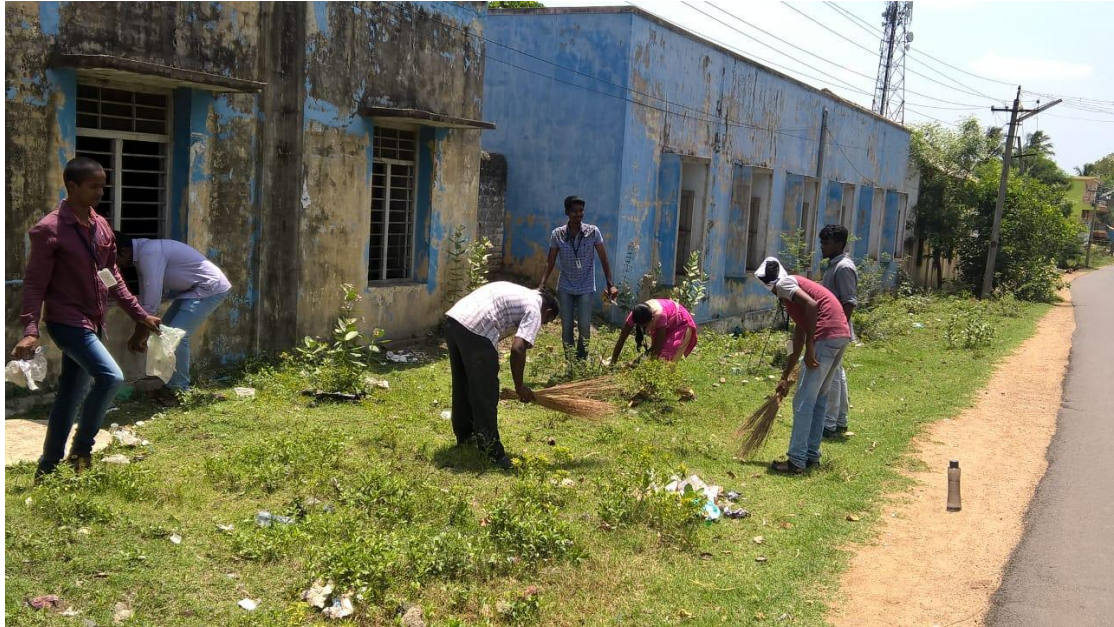
Street Cleaning at Bajanai Koil Street on 05.07.2018 (500 meters)