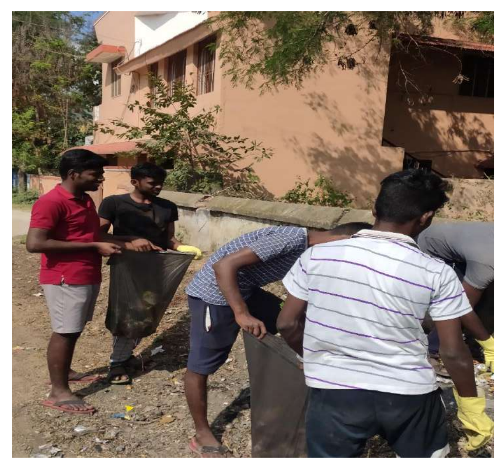
All the volunteers were actively engaged in all activities with passion and interest. After breakfast, volunteers resumed their cleaning activities from 10.30 am to 11.30 am. Refreshments were provided at 11.30 am.