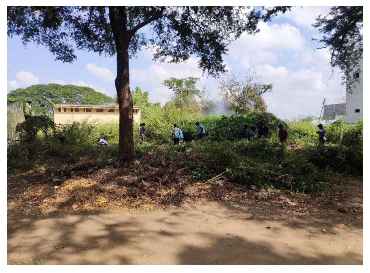
All the volunteers were actively engaged in all activities with passion and interest. During the cleaning activities, volunteers were guided by Dr. S. Caleb Noble Chandar and